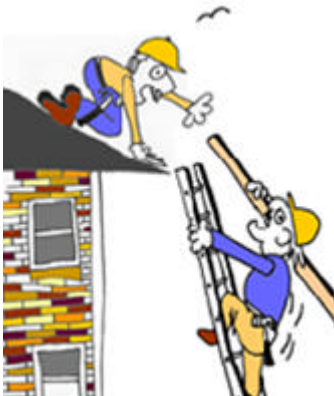
Positions and Actions of people at risk!

New study results from Task Analysis Safety Cards have been tabulated from recent turnarounds. Some trends become visible when looking at these cards as a group. Highest hazard in this set of T.A.S.C. cards was a risk for slips, trips and falls. Number two was particle in eye, closely followed by cuts, sharp edges. We will analyze a set of cards for hazard tracking from your job-site for a nominal processing fee.