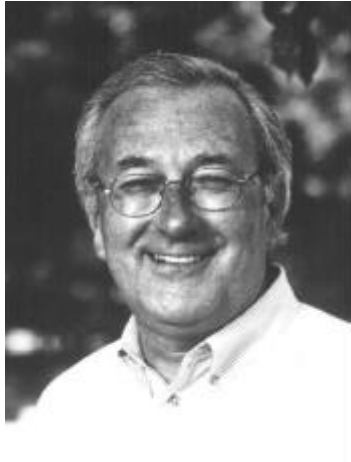
Founder and Vice-Chair of the Safe Communities Foundation of Canada