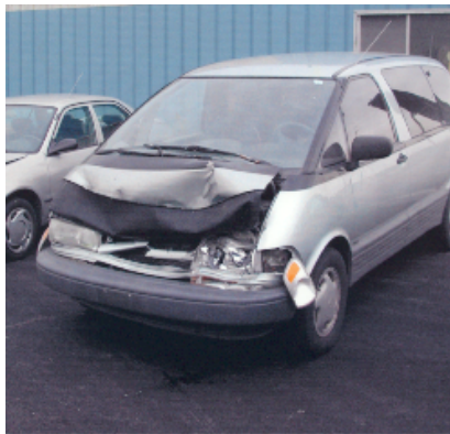
deer vs van on highway 403 Nov 19th

NATIONAL CONFERENCE October 22 nd , 23 rd and 24 th 2003 Plans are underway for the Lambton Safe Community Council to host this National event. Mark your calendar now. You won't want to miss it!