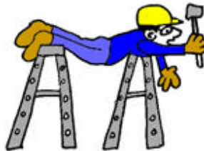
Positions and Actions of people at risk!

The results of the many Behaviour Based Safety re-certification interviews are being reviewed. Initial feedback indicates that we should incorporate T.A.S.C. and Near miss reporting cards into the Observation sheets. Others have suggested that there be links between the software programs.